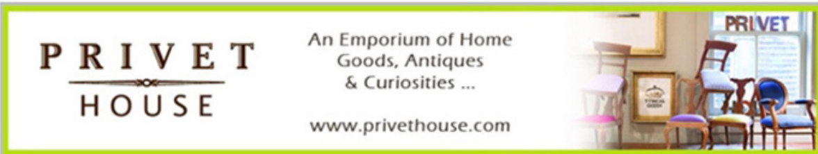
Footer Ad (1000x185 pixels)