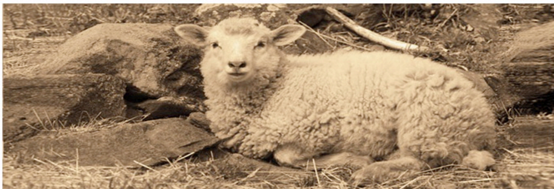
Banner Ad ($200-350 975x375 pixels)