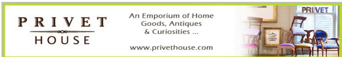
Footer Ad ($250-300 1000x185 pixels)