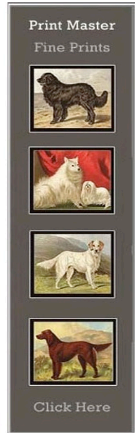
Skyscraper ($300 160x600 pixels)