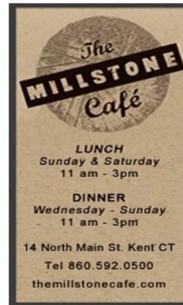
Large Ad ($200 160x300 pixels)