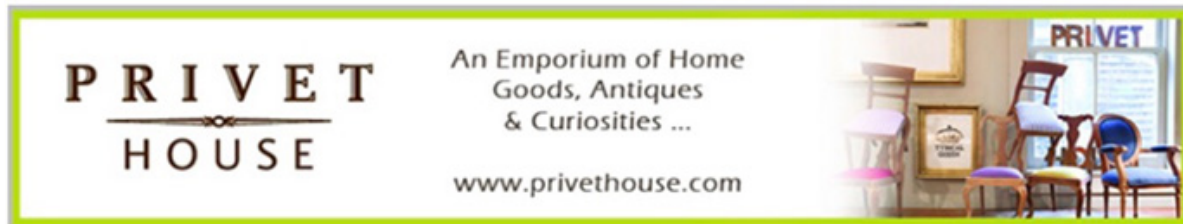
Footer Ad (1000x185 pixels)