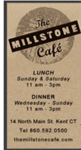
Large Ad (160x300 pixels)