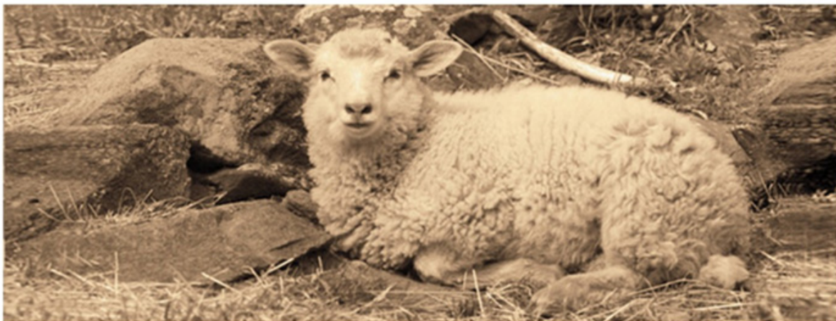
Banner Ad (1140x435 pixels)